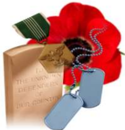
Memorial Day May 31, 2010